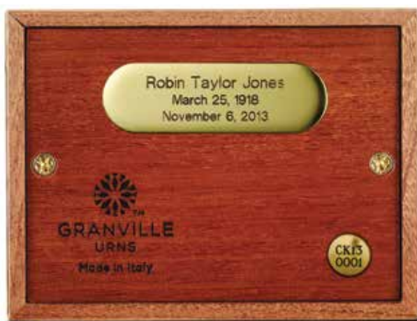
Brass name plates are available in Times Roman, Helvetica, and Script.

Our pieces can be engraved and shipped within 24 hours